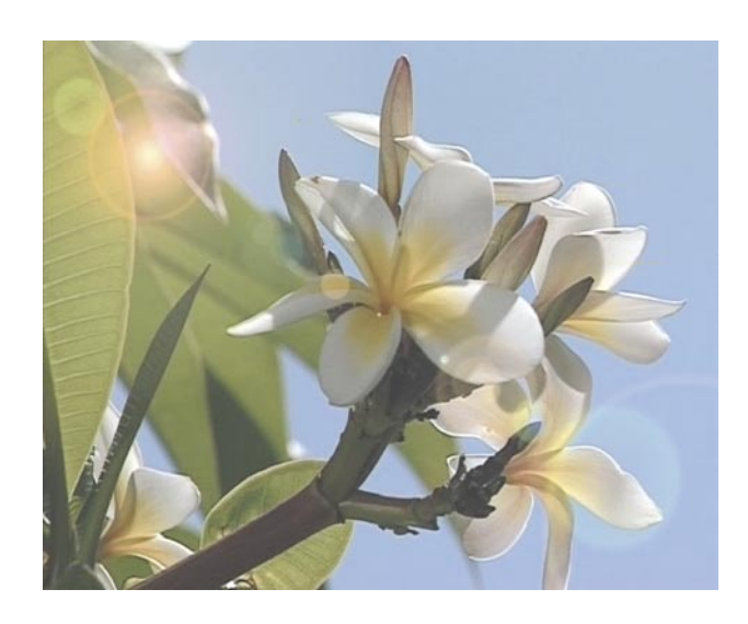
Try out a couple of settings – you will be surprised by the results!

You could, for instance, also use a scene filmed when the sky was overcast and then use the lens reflections to give the impression that the sun was actually shining.